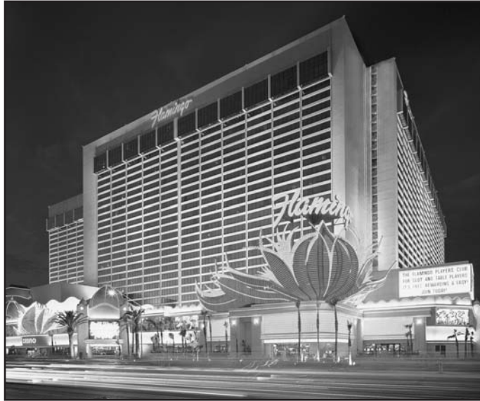
Flamingo Hotel, Las Vegas, NV